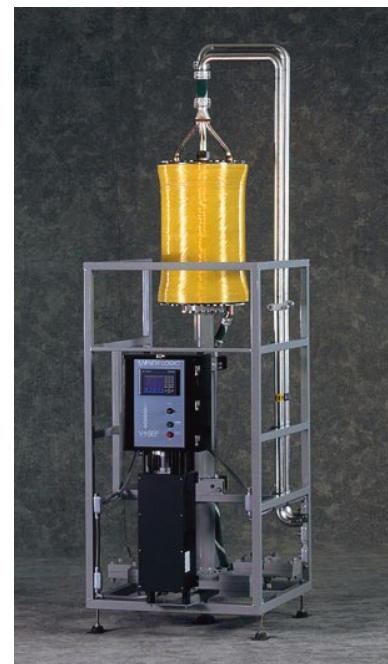
Fig. 3 An Industrial-Scale Series i System

Figure 3 presents a photograph of an industrial-scale Series i system.